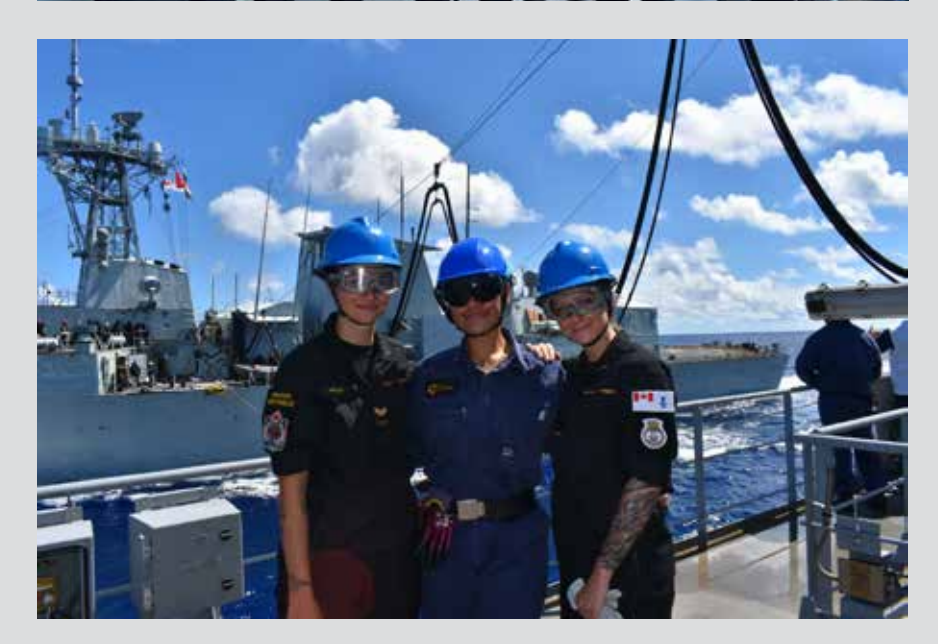
From the top: HMCS VANCOUVER; Armed with goodie bags, VANCOUVER personnel get ready to leave AOTEAROA by seaboat; HMCS VANCOUVER sailors join in with AOTEAROA's Maori Culture Group; VANCOUVER and AOTEAROA personnel work together during a Replenishment at Sea exercise.